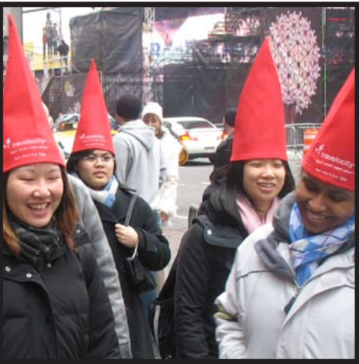
20,000 hats given out to spectators