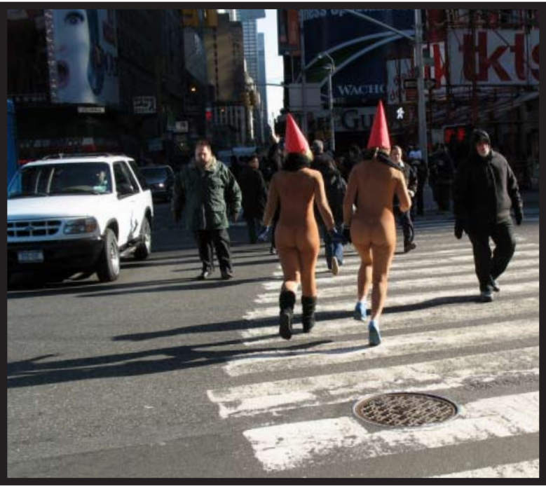
Streakers in Times Square and NY City