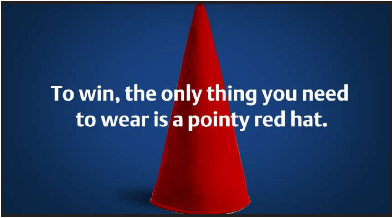
Spot on Jumbotron in Times Square