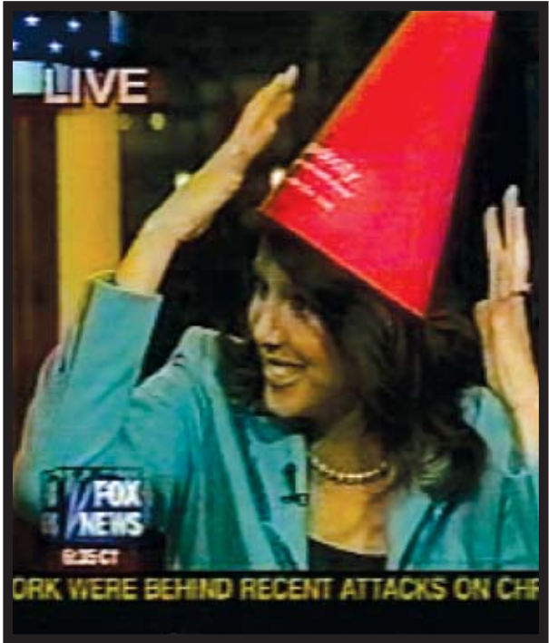
News coverage during New Year's