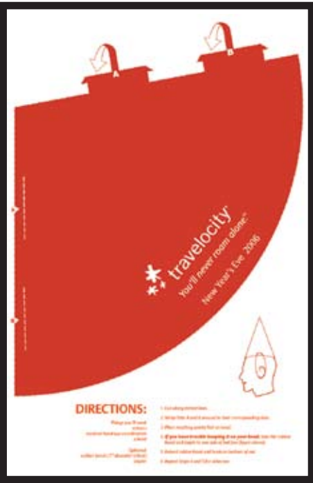
Online build your own hat page